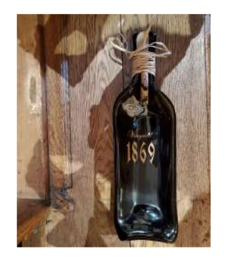
As a platter for cheese and crackers:

Wine bottle can be flattened in a kiln and used as a platter.